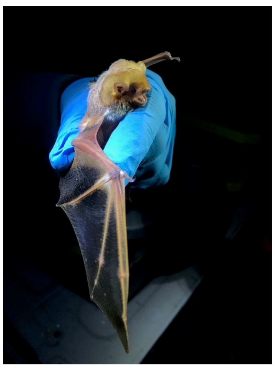
Figure A-2. Captured Eastern Red Bat ( Lasiurus borealis ) on NSA Annapolis, Annapolis MD, 17-21 June 2019