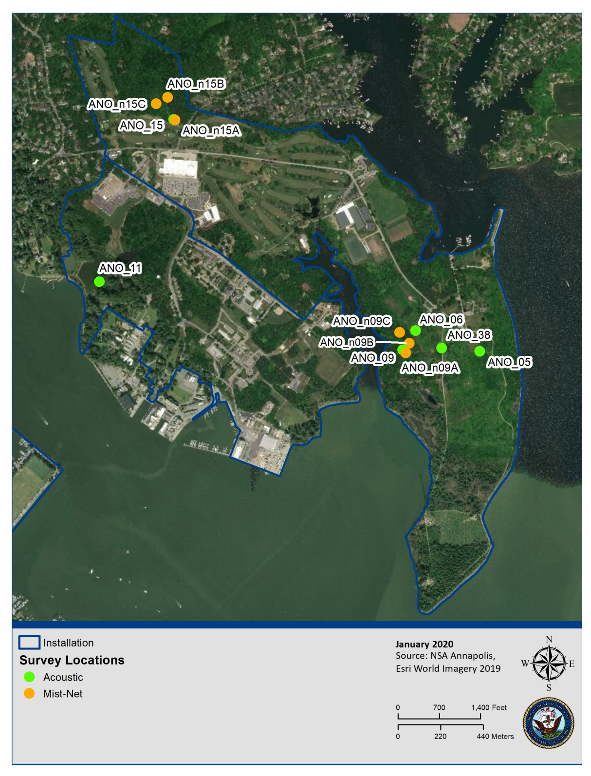
Figure 2-2. NSA Annapolis Overview Map with Survey Sites