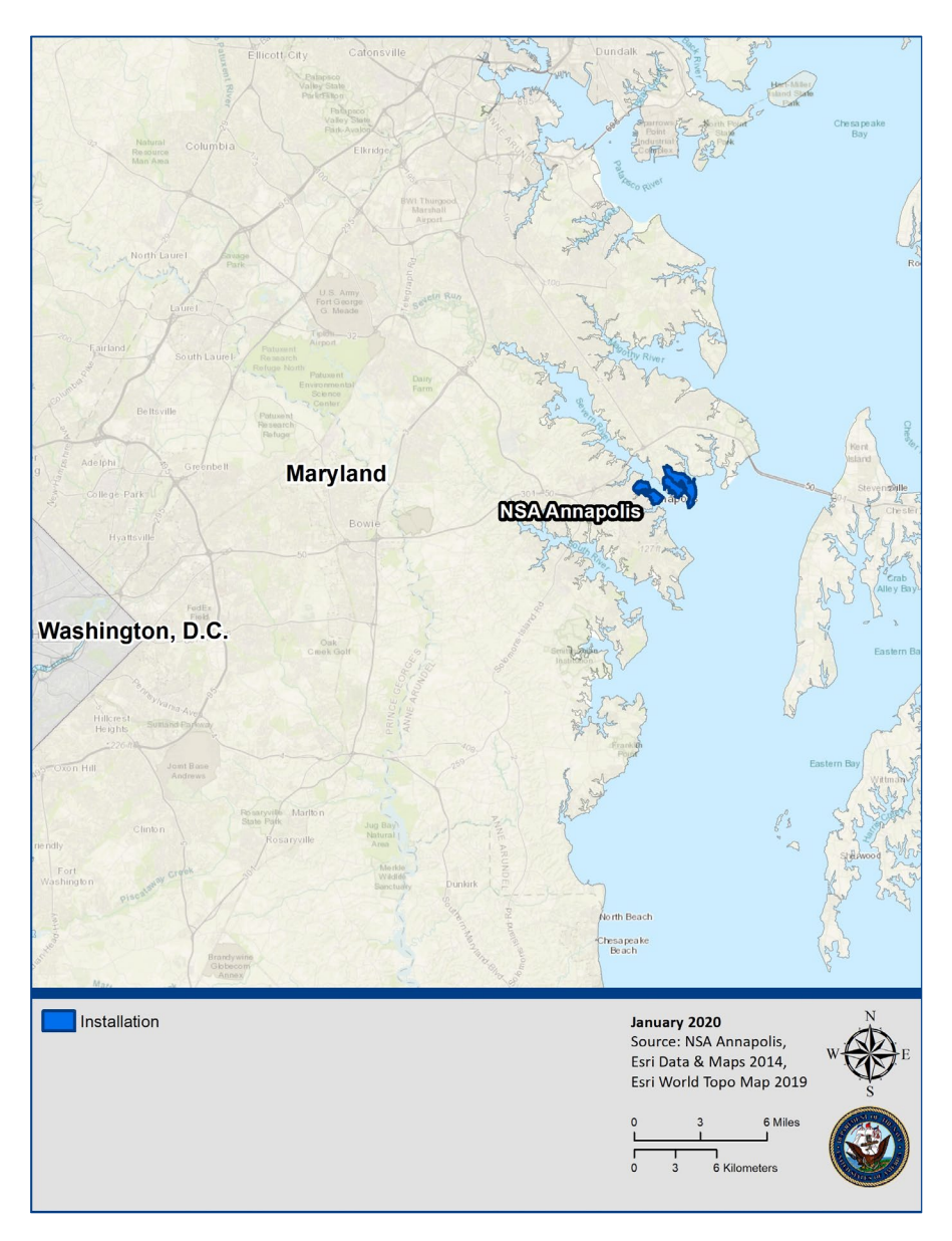
Figure 2-1. Project Location

NSA Annapolis is approximately 1,500 acres (6.07 square kilometers) and is located in Anne Arundel County, Maryland approximately 30 miles east of Washington, DC and 20 miles southeast of Baltimore (Figure 2-1). Anne Arundel County is in the Western Shore Region of Maryland and is bordered to the east by the Chesapeake Bay. NSA Annapolis and the U.S. Naval Academy are divided by the Severn River, with the U.S. Naval Academy to the west and North Severn, including Greenbury Point, Possum Point, and the U.S. Naval Academy Golf Course, to the east. Bat surveys were conducted on North Severn.