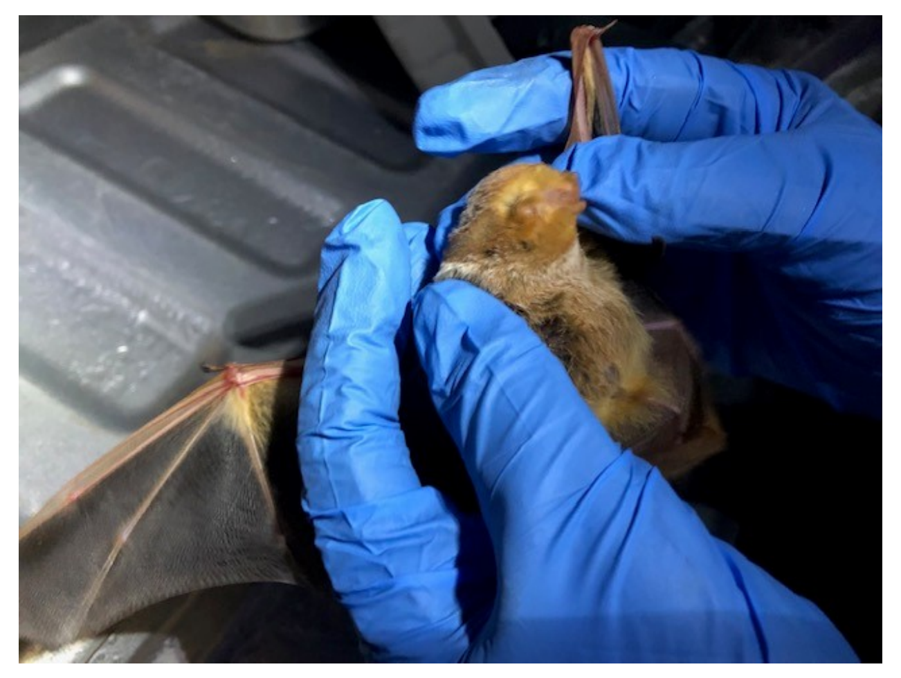
Figure A-3. Captured Eastern Red Bat ( Lasiurus borealis ) on NSA Annapolis, Annapolis MD, 17-21 June 2019, Photograph by Michael St. Germain